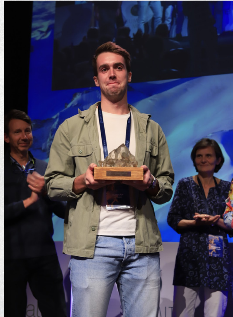
2022 Winner BeFC

Eco-friendly paper-based biofuel cells to replace batteries