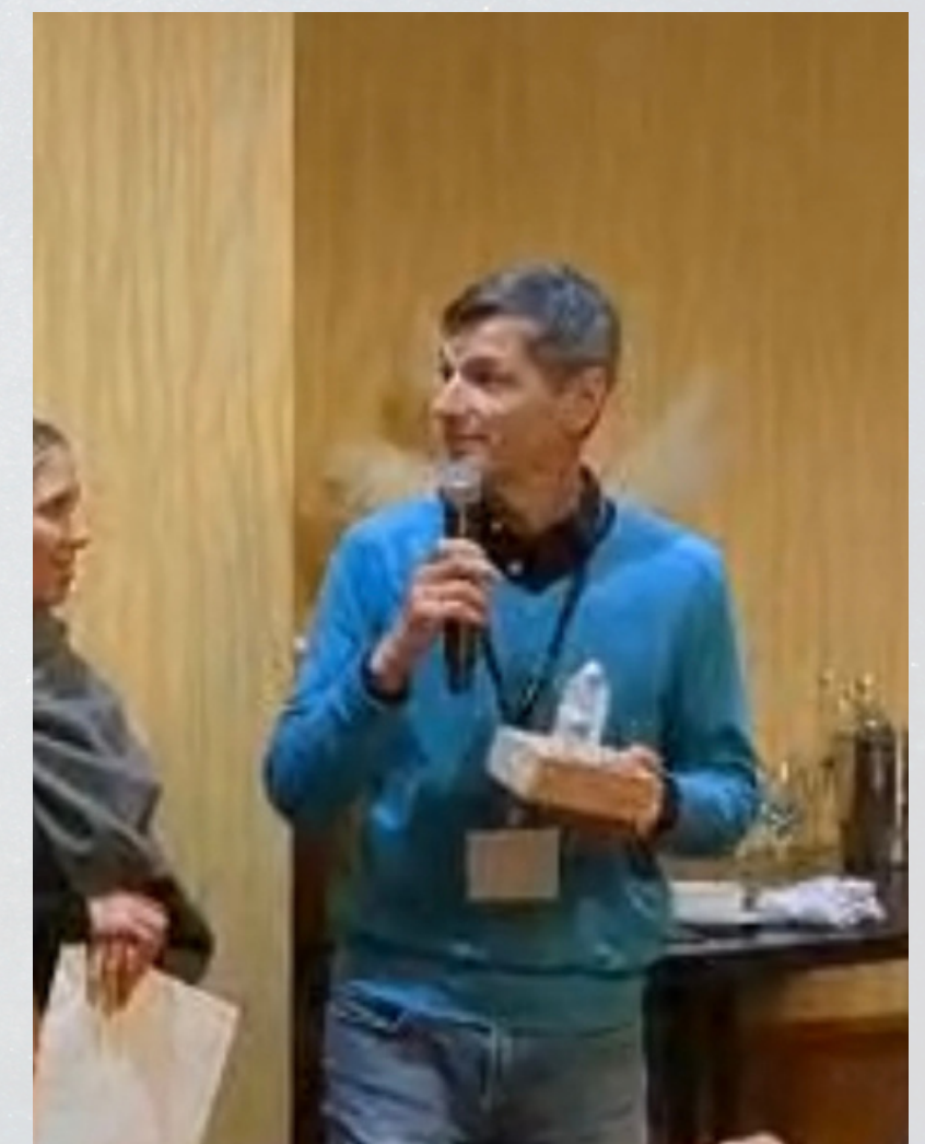
2023 Canada G4N Winner Calmura Natural Walls

High-performance biocomposite wall system using waste wood