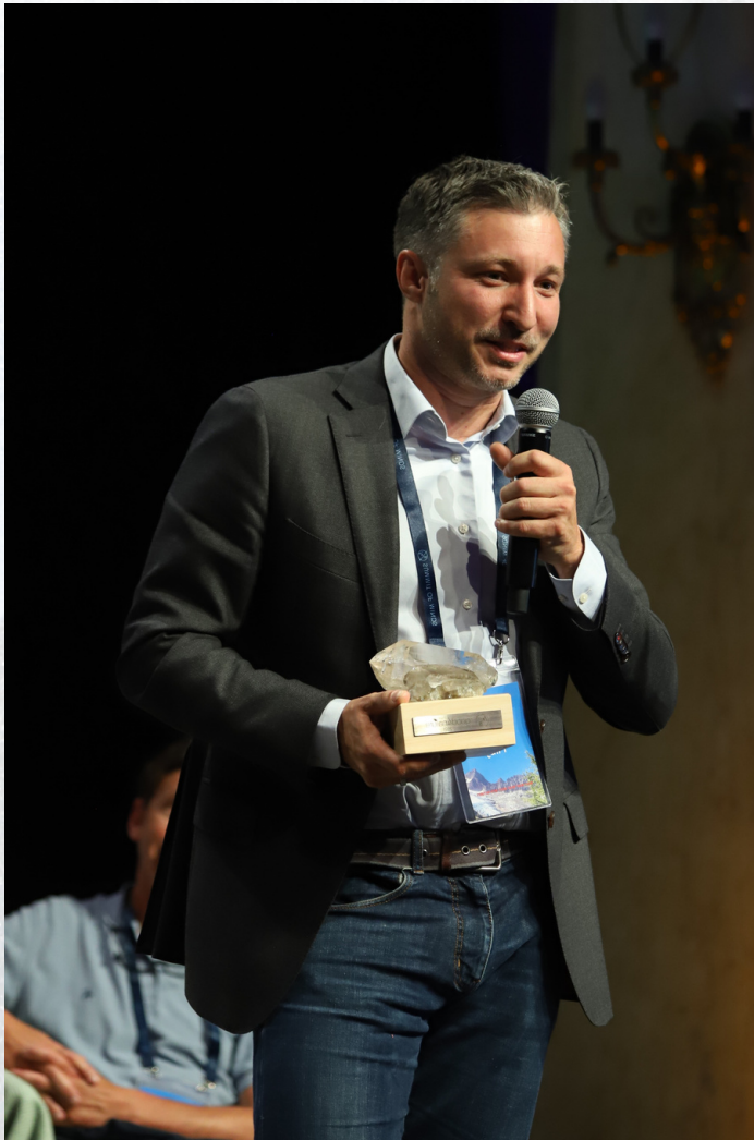
2021 Winner Dendra

AI and drone automation to rehabilitate natural ecosystems