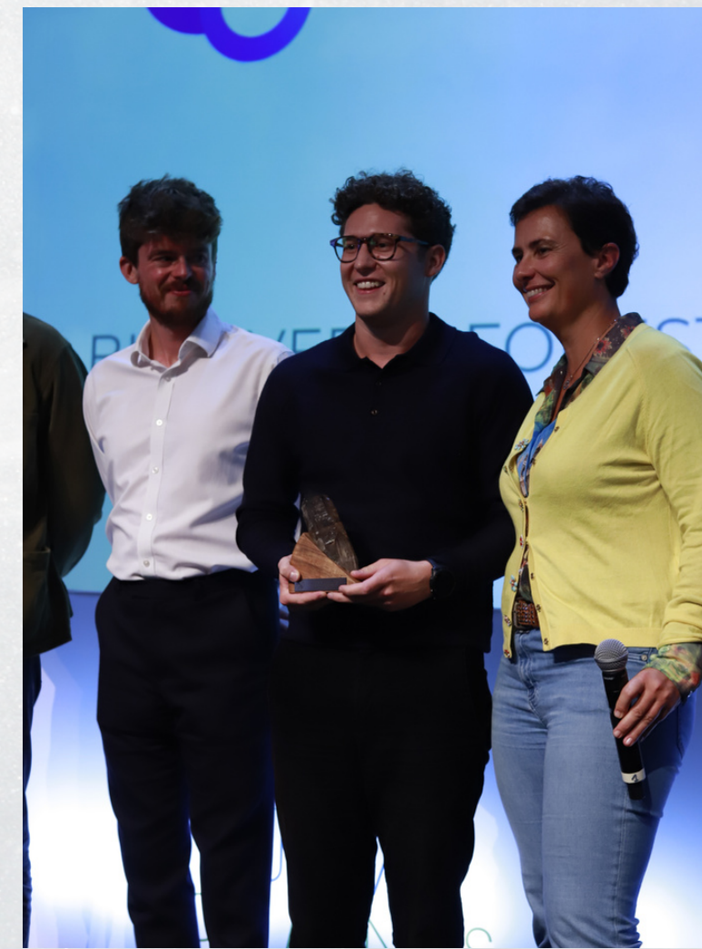
2023 Winner MORFO

Unique tech for large scale ecological restoration of forest ecosystems